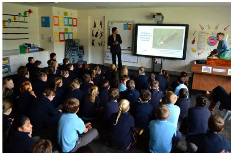
Representatives of the Wadi Wadi community and the APC jointly present a platypus class at a local school.

In response, the Wadi Wadi community has joined forces with Friends of the Earth Melbourne to establish the Matakupay Project, which aims to re-establish a locally viable platypus population. The APC has recently assisted this project by assessing platypus habitat quality and contributing to awareness of relevant conservation issues through a public talk, school classes and extensive media coverage. Unfortunately, the feedback to date appears to confirm that platypus have effectively disappeared from the Swan Hill-Nyah section of the Murray itself.