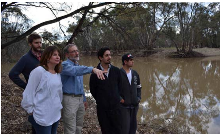
An APC biologist and members of the local community inspect riparian habitat near Swan Hill.

The good news is that the species may still occur in the Little Murray River, an anabranch of the Murray that rejoins the main river near Swan Hill. Furthermore, many of the Murray’s most pressing environmental problems will potentially be ameliorated by implementing the recently approved Murray-Darling Basin Plan. It is therefore quite possible that platypus will eventually be able to colonise the Swan Hill-Nyah area, particularly if a few animals still remain in the Little Murray River system.